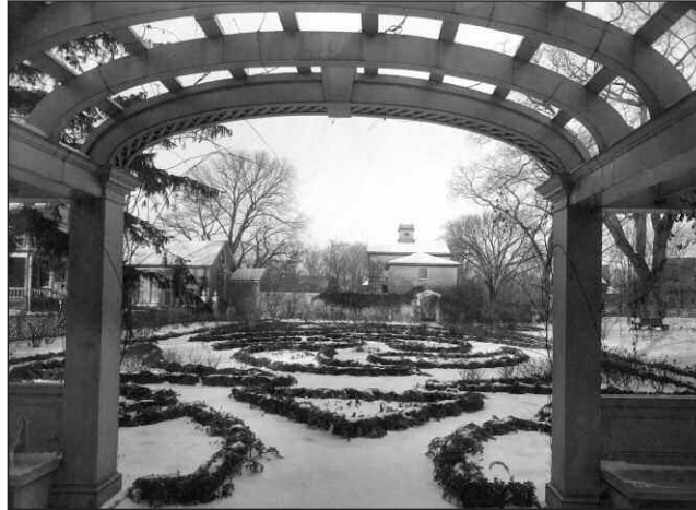
Looking through the pergola towards the carriage house, 1905

Visitors to the newly renovated formal garden will notice the most dramatic changes. Perhaps most striking, the missing Colonial Revival pergola, designed by the landscape architect Martha Brookes Hutcheson, has been reproduced and once again provides not only a focal point but also a private and shady spot, a "resting