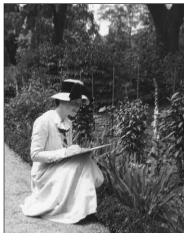
Sketching in the garden, late 1920s

had founded Radcliffe College. She was involved with various fundraising efforts for the college and established a traveling fellowship for Radcliffe graduates. A number of the early Radcliffe commencements took place in the Longfellow House library followed by tea in the garden. On September 22, 1905, Radcliffe alumnae from 1885 to 1905 commemorated Alice's involvement with Radcliffe