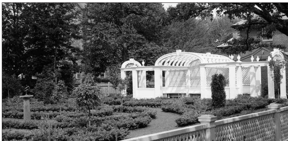
The rehabilitated pergola in the formal garden, 2005