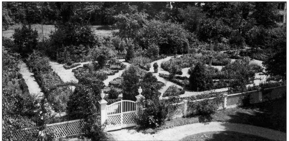
Aerial view of the Longfellow House formal garden, 1935

Martha Brookes Hutcheson wrote in a letter in response to the Historic American Building Survey in 1936, "The Longfellow Garden at Cambridge I overhauled entirely. It had gone to rack and ruin. I reset box in the Persian pattern which the poet had